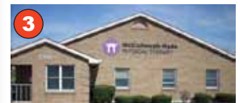
McCullough-Hyde Physical Therapy & Rehabilitation, Hamilton