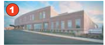
McCullough-Hyde Memorial Hospital, Oxford