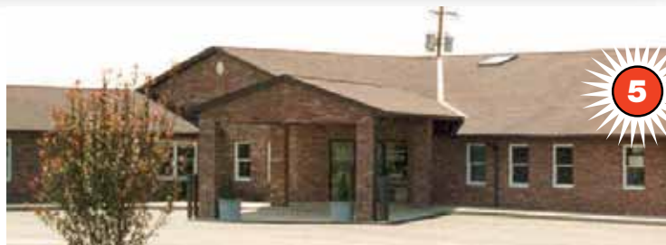
McCullough-Hyde Medical Building • Brookville, IN