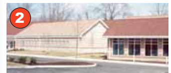
McCullough-Hyde Medical Building, Oxford