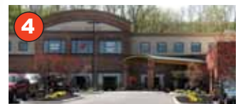
McCullough-Hyde Outpatient Services, Ross